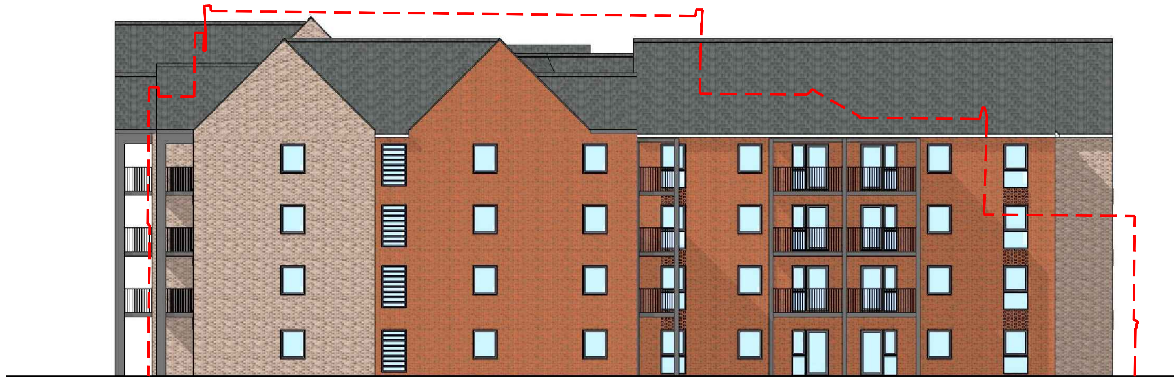
BLOCK B - EAST ELEVATION