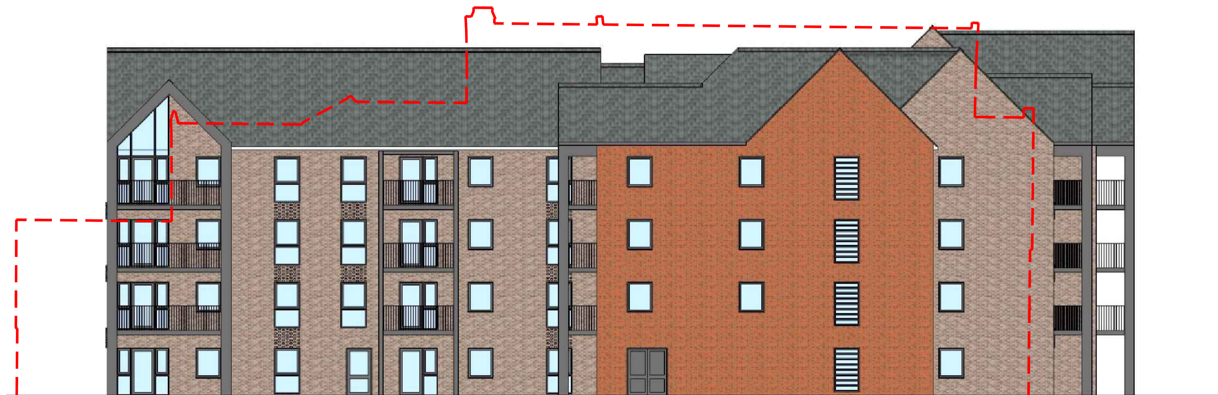
BLOCK B - WEST ELEVATION